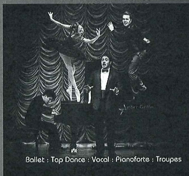
Ballet : Tap Dance : Vocal : Pianoforte : Troupes

Open Dance Workshops for ALL - including NYPA NOMINEES